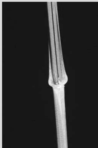
Quackgrass has distinctive clasping auricles that grasp the stem at the base of each leaf.

For severe infestations, use a cultivated fallow in the summer. Use a spring or spike-tooth harrow during the hot, dry part of summer to bring rhizomes to the surface where the sun can dry and kill the rhizomes. If a harrow is not available, repeated disking at intervals that allow small pieces of rhizome to regrow and exhaust the rhizome, but do not put any more energy back into the rhizome will starve the rhizomes (Westwood et al.).