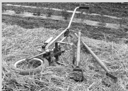
Wheel hoe, 3 1/4-inch stirrup hoe, 5-inch stirrup hoe, straw, plastic mulch

Beds are on 5-foot (60-inch) centers with a 1-foot pathway and 4-foot beds; rows spaced 60 inches (1 row), 24 inches (2 rows), 10 inches (4 rows), or 5 inches (6 rows)