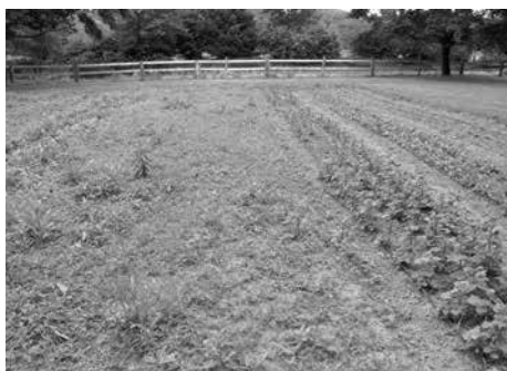
Galinsoga covering this bed likely arrived with compost added the year before.

Weed seeds may hitch a ride to your farm in cover crop or forage seed, straw, hay, compost, or manure. For example, at the Seed Farm in Vera Cruz, Pennsylvania, cocklebur was introduced to the farm with municipal compost. Knowing the source of your inputs and discussing weed seed contamination with the farmer or company you get them from is a good practice. One way to reduce introducing foreign weed seed is to clean your seed (especially cover crop seed) and use farm-generated inputs such as mulch, compost, and manure. Mowing adjacent areas and field edges is also a good practice to prevent weed seeds from blowing into your fields.