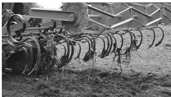
Rotation with bare fallow. Field cultivators with rows of tines or sweeps can be used to dig up and lift quackgrass rhizomes to the soil surface where they will dry out and die in hot, dry weather.

When the weeds are still tiny, follow up the flush of weeds with shallow cultivation (or flaming). In especially problematic areas you may need to repeat this practice a few times. This practice works best when there is adequate rainfall to facilitate the germination of weed seeds, so keep an eye on the weather and consider irrigation, if possible. A tine weeder does a good job of this shallow tillage.