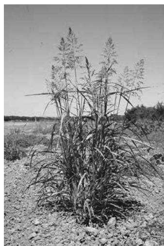
Know your enemy. Young johnsongrass plants look a bit like corn, but don't be fooled.

emerges from rhizomes (underground storage structures that look like thick creamy-colored roots) in mid-May and can grow to 7 feet tall by July. Giant ragweed is an annual weed that can be just as much of a nuisance. Take the time to identify weeds on your farm so that you can avoid an uphill battle when you're starting off.