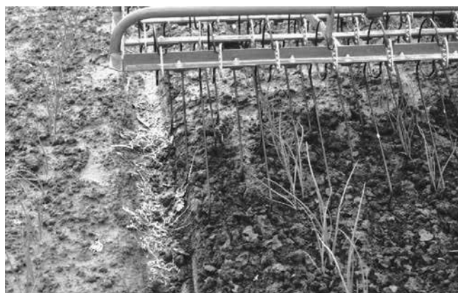
Tine weeder.