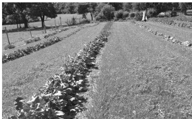
Minimize niches for weeds in the field. Terry Kromer from Clear Springs Farm in Easton, Pennsylvania, got "tired of killing weeds all the time" and started planting annual ryegrass between beds with a drop seeder. She uses a flat plastic layer that allows her to mow right up to the bed.

In 2005 researchers at Cornell University had a sweet corn crop with ineffective weed control. Four- and five-foot-tall pigweed shed thousands of seeds. Researchers measured 12,000 seeds per square foot. They knew if they followed sweet corn with early salad mix or another early crop without a lot of cultivation they would be in trouble. Instead, in 2006 they planted fall cabbage. The cabbage was easy to cultivate. Cultivation and just one pass with a hand hoe kept pigweed from going to seed. When they measured the seed bank again, there were only 3,000 seeds per square foot, one-quarter of what they had the year before (Mohler 2011).