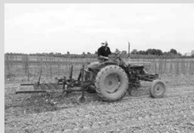
Kubota with belly- mounted cultivators and tool bar with tine weeder.