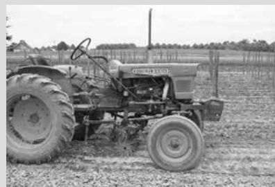
Bezzzeridi spider cultivators will break a crust but not throw much soil.

5-foot centers (43-inch bed tops with 17 inches between beds); rows are spaced 15 inches apart (3 rows), 30 inches apart (2 rows), or 60 inches apart (1 row)