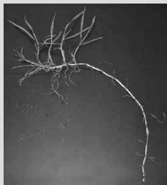
Know your enemy. A single quackgrass rhizome node can produce 14 rhizomes with a total length of 458 feet in one year.