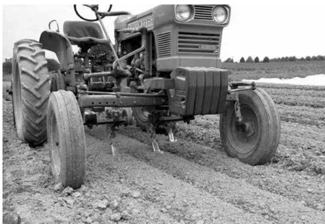
Kubota with belly mounted sweeps.